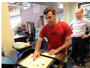
Gay-Led SF Center Promotes the Art of Bookmaking