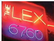
'Bootycandy' at the Celebration Theatre's New Digs