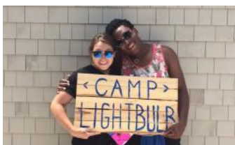
Camp Lightbulb