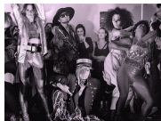
'Shake Your Groove Thing!' The Dance Cartel Brings 'ONTHEFLOOR' to Boston