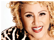
Darlene Love: A Much Deserved and Dynamite Debut