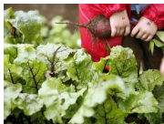
Food For Thought, Food For Life