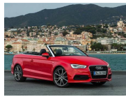
Audi A3 Cabrio Provides Drivers with Low-Priced Luxury