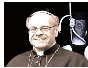
Catholic League Defends Swiss Bishop Who Wants Gays Put to Death