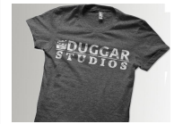
Would You Wear This? Duggars Go Into the T-Shirt Business