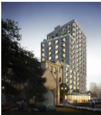
Ingersoll in Fort Greene, Brooklyn.

These residences are made possible through partnerships with local government and developmental partners. SAGE launched a National LGBT Elder Housing Initiative in 2015, in response to evidence of widespread discrimination against LGBT people in senior housing. When paired with services, these residences keep LGBTs from being forced back into the closet as they age.