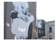
Catholic Soul-Searching in Ireland Over Vote on Gay Marriage