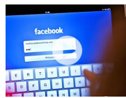
Facebook Doing Research on Artificial Intelligence