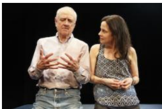
Denis Arndt and Mary-Louise Parker

Drama Desk Award winner Mark Brokaw directs Mary-Louise Parker and Denis Arndt in a spirited two-hander, "Heisenberg," running for six weeks at New York City Center.