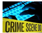
US State Dept. Employee Faces Hacking Charges