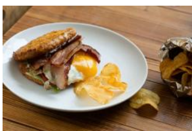
The Double Brown at Hudson Jane.