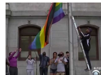
Watch: Philadelphia Debuts New Rainbow Flag with Black and Brown Stripes