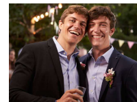
Is Marriage Equality a Boon for the Housing Market?