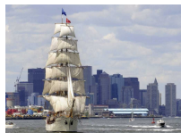
They're Shipping In: Boston Hosts More Than 50 Tall Ships