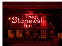
Google Gives Grant to Preserve Oral History of Stonewall Inn