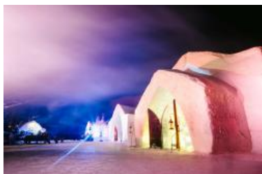
Hotel de Glace.

It's all about getting your body temperature up via the numerous hot tubs located around the hotel. After that, guests are instructed to return to their regular, non-ice hotel rooms at the Valcartiers Hotel and completely dry off.