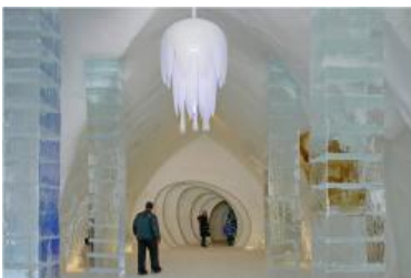
Hotel de Glace

You've seen it in James Bond movies and on the Travel Channel, and somewhere along the line, staying overnight in an ice hotel made it onto your bucket list. Trekking to Norway, Sweden or Finland to find a hotel entirely made of ice may be outside of your travel budget, but an evening at Canada's Hôtel De Glace can make this dream a reality.