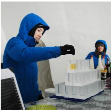
Cocktails at Hotel de Glace.

Winter fun reaches its zenith at Valcartier Vacation Village, the biggest winter recreation park in North America. This huge, four-star hotel boasts a winter playground complete with ice rafting park featuring nearly 30 slopes, ice skating, a children's playground, plus Bora Park, a huge, indoor, Polynesian-themed water park.