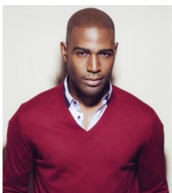
Karamo Brown