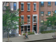
Bea Arthur Shelter for LGBT Homeless Youth in NYC to Open in Early 2017