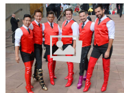
GALA Choruses 10th Quadrennial Conference Part Two