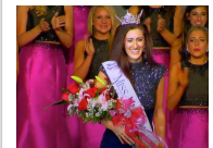
There She Is: Out of the Closet, and Ready for Miss America