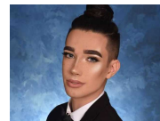
Teen Re-Shoots High School Yearbook Photo, Goes Fabulously Viral