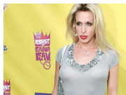
Transgender Actress Alexis Arquette Has Died at 47