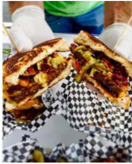
"The Defibrillator"

straight for the delicious pulled pork and barbecue ribs at Dinosaur BBQ, or Gianelli sausages with peppers and onions.