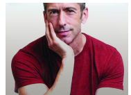
Dan Savage: Josh Duggar Deserved to be Outed as Adulterer