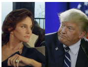
In New Interview, Trump Comments on Gay Marriage, Misgenderers Caitlyn Jenner