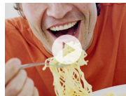
The Science Behind Stress Eating