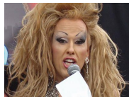
Chi Chi LaRue Reaches Out to Fund Rehab