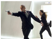
Hitman: Agent 47