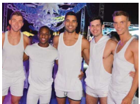
33rd Annual White Party Week: Events Schedule