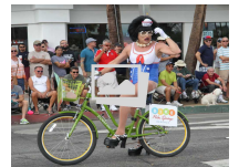
Palm Springs Pride Parade :: November 5, 2017