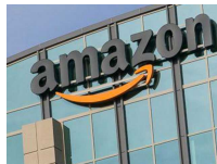
Retailers Look to Woo Shoppers from Rivals as Amazon Grows