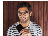
Felix Gray: Computer Glasses for a New Generation