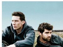
Talking 'God's Own Country' with No Topic Taboo