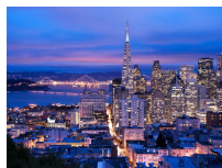
Seven Gay Wonders of the World 2018: San Francisco