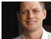
Texas GOP Gov Challenger Tweets He'd 'Gladly Execute' Gays