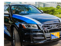
Insider Q&A: Aptiv Spins Off to Speed Automated Driving