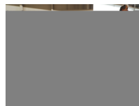
Splurged on an Expensive Gift? Don't Forget to Insure It