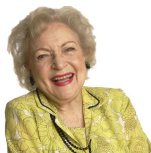
Betty White to Receive Lifetime Achievement Award