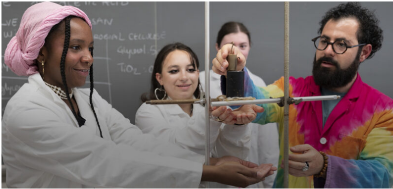
Inclusive STEM classrooms lead to efficient problem solving.