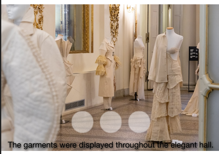
The garments were displayed throughout the elegant hall.