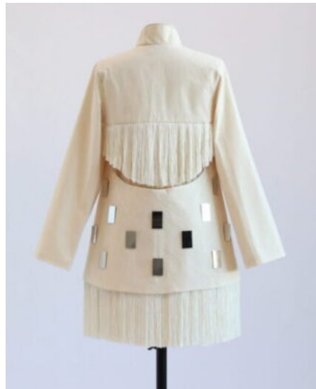
Hudson's fringed jacket exposed her mirrored minidress.

Montana native Anna Hudson evoked Western influences via her contemporary minidress (pictured at right) decorated with small mirrors, coupled with a fringed jacket with cutouts that exposed the mirrors.